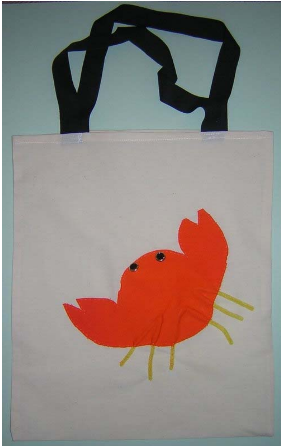
Seaside Bag by Gill Tanner