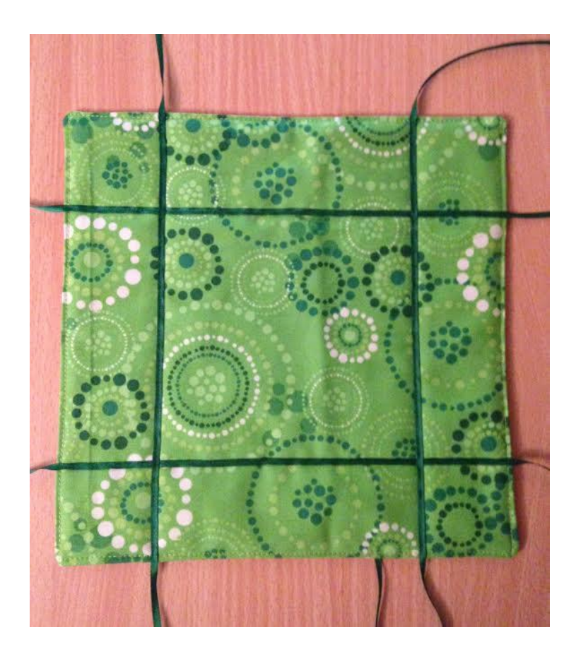
8. Tie the ribbons to form the basket. Done!