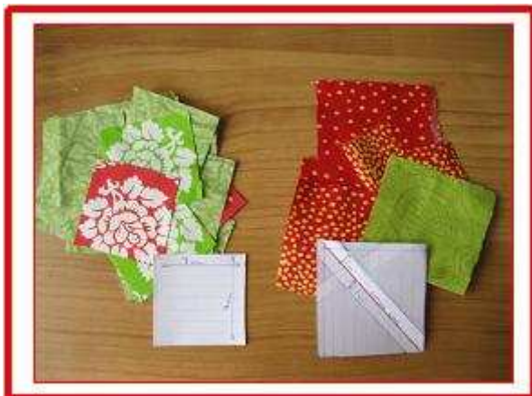
Make a 4-patch squares.

Your finished quilt will measure 30 x 30 cm (12 x 12 inch). All "seams allowance" are 1cm ( 1/4 inch) wide.