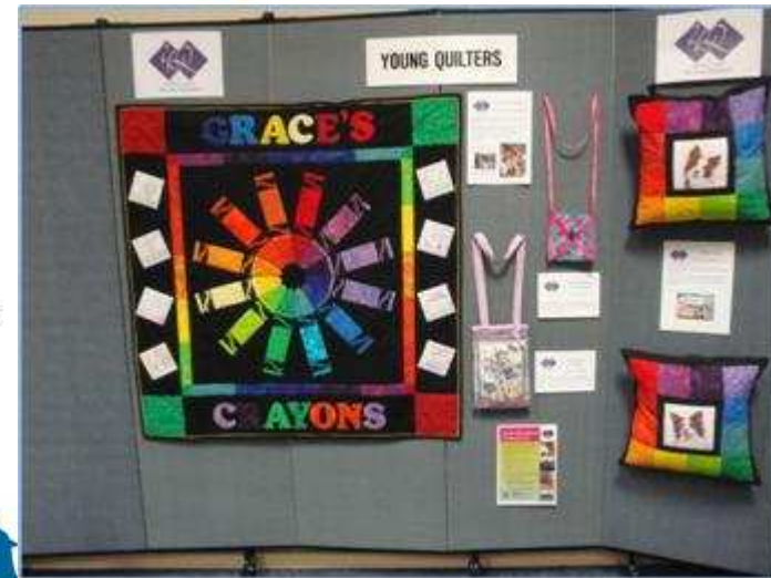
Local exhibitions and competitions