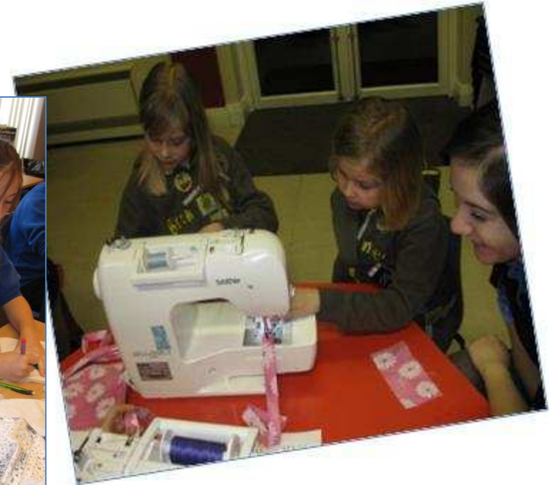
Local Uniform groups