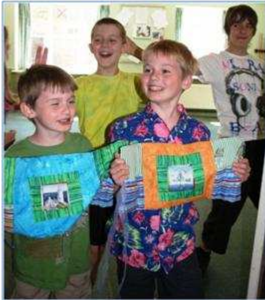
YQ workshops in the local community