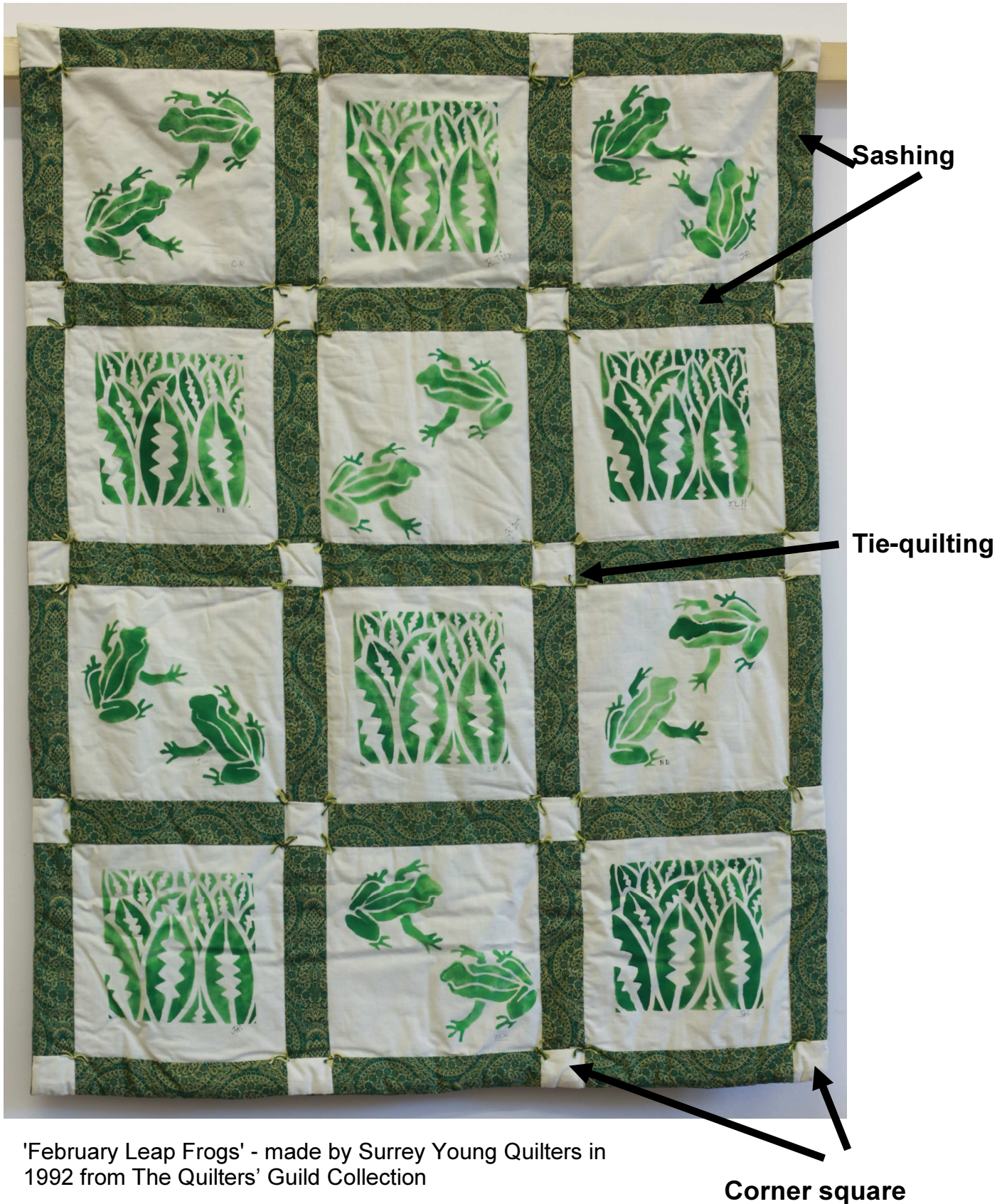
'February Leap Frogs' - made by Surrey Young Quilters in 1992 from The Quilters' Guild Collection