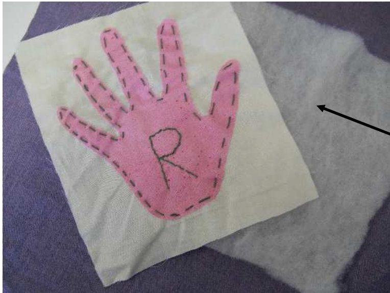
Wadding (middle layer)