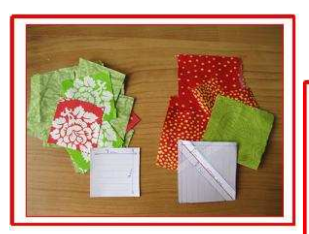
Make a 4-patch squares.

Your finished quilt will measure 30 x 30 cm (12 x 12 inch). All "seams allowance" are 1cm ( 1/4 inch) wide.